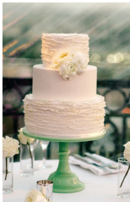
The Butter End Cakery created the delicious chocolate and almond cake.