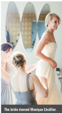
The bride donned Monique Lhuillier.