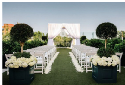
A rooftop outdoor ceremony at The London West Hollywood wowed guests with beautiful city vistas.