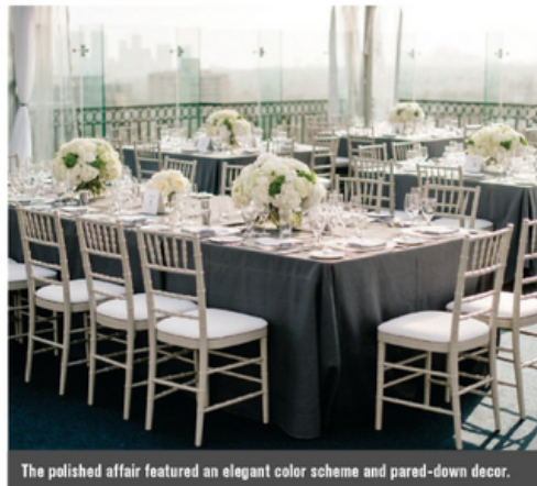
The polished affair featured an elegant color scheme and pared-down decor.